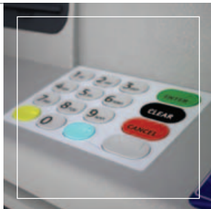
^ Encrypting PIN Pad Security and standards compliance

NCR's success stems from continuous technological innovation and a strong commitment to understanding the present and future needs of customers and consumers. NCR offers hardware, software and services that deliver advanced transactions and unrivalled levels of availability.