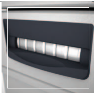
^ Cash Dispenser Proven technology for high availability