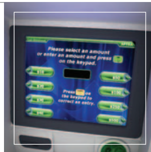
^ Touchscreen Maximum ease of use and flexibility