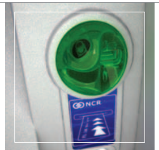
^ Card Reader Fraud prevention built-in