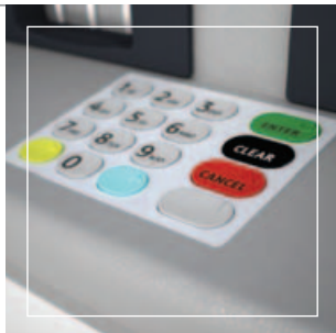
^ Encrypting PIN Pad Security and standards compliance

NCR's success stems from continuous technological innovation and a strong commitment to understanding the present and future needs of customers and consumers. NCR offers hardware, software and services that deliver advanced transactions and unrivalled levels of availability.