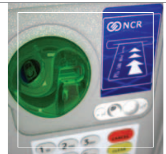
^ Card Reader Fraud prevention built-in