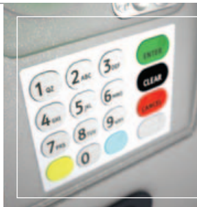
^ Encrypting PIN Pad Security and standards compliance

NCR's success stems from continuous technological innovation and a strong commitment to understanding the present and future needs of customers and consumers. NCR offers hardware, software and services that deliver advanced transactions and unrivalled levels of availability.