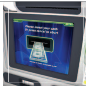
^ Touchscreen Maximum ease of use and flexibility